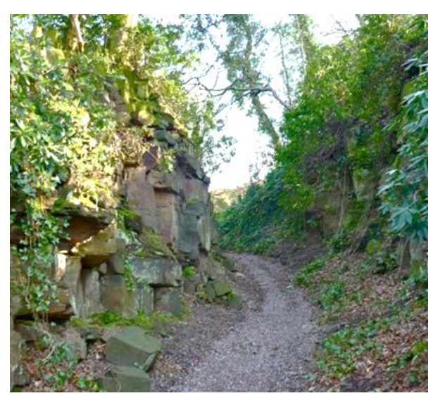
Ravine south of Eddisbury Hall (Jane Gooch)

At Eddisbury Hall , near Macclesfield, there is a path through a dramatic/picturesque ravine in a former stone quarry from which a path and steps lead to a hillock or high point offering great views across the Cheshire Plain. The effect is of passing through something potentially quite dark and mysterious to reach the light - all very Repton picturesque.