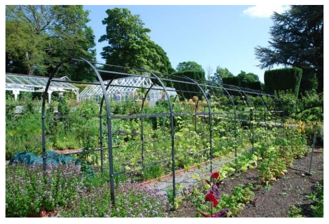
A view of the kitchen garden

On leaving the reception hall the first sight is the view over the Scented Terrace and beyond this, the vegetable garden. In the background is the Orangery, completed in April 2009, and located on the site of the original vineries of 1890s. It is useful when, according to the gardeners, the planting is some four weeks behind that of Cheshire; this year there was a frost in June.