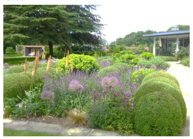
The parterre garden looked simply stunning, with just five or six plants repeated in drifts, some still and others waving in the wind.

The first phase was implemented by contractors, after which the present gardening team of three full time staff were employed to maintain the new gardens and develop the second phase 'in house'.