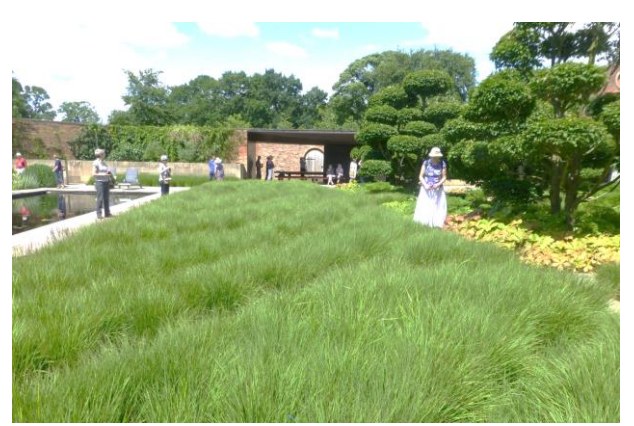
The pavilion with cloud pruned hornbeam (right), ornamental grass and reflective pool

The walled garden, entered by beautiful bronze gates, is just full of interesting planting. It has three different areas overlooked by a graceful and spacious contemporary pavilion for entertaining, one of three designed by Jamie Fobert.