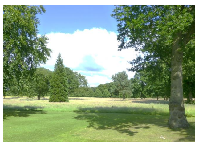
The parkland with a recently established Wellingtonia

The formal lawns are cut twice a week and until recently a large swathe of parkland surrounding the Hall was cut to the same regime.