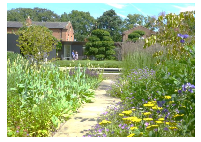
Looking across the walled garden

wonderful combinations of herbaceous species set in gravel.