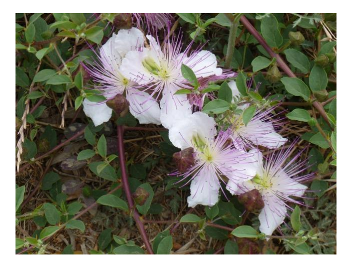
Above: the caper plant Below: Squirting cucumber