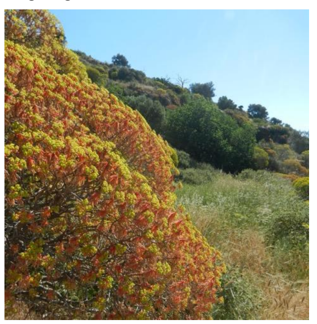
Euphorbia bushes on a hillside

(Euphorbia dendroides), the leaves taking on an orange tinge.