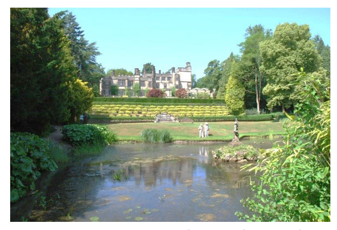
Looking back to the house from the far side of the lake.

Looking towards the east front of the Hall from the Koi Lake a bank of variegated holly bushes can be seen. Above this the Italian Garden, with the herbaceous border beyond, is adjacent to the house.