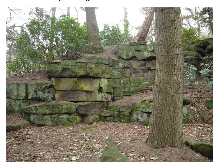
Above: the Quarry Garden at Foxhill

At Foxhill , Frodsham, a small quarry is indicated on the 1875 Ordnance Survey map, but by 1910 a more extensive quarry is shown. It appears that the original quarry was enlarged for large stones placed on the outer edge to enclose the quarry or Japanese style garden. Some of you may remember visiting Foxhill a few years ago.