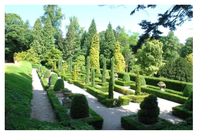
A view of the Italian Garden

On the northern side of the Italian garden is the Water Garden and grottos. The water in the garden is naturally fed. It comes off Longstone Edge and passes under the village of Great Longstone and the old railway line adjacent to the estate. It flows through the gardens and eventually joins the main lake at the entrance to the drive.