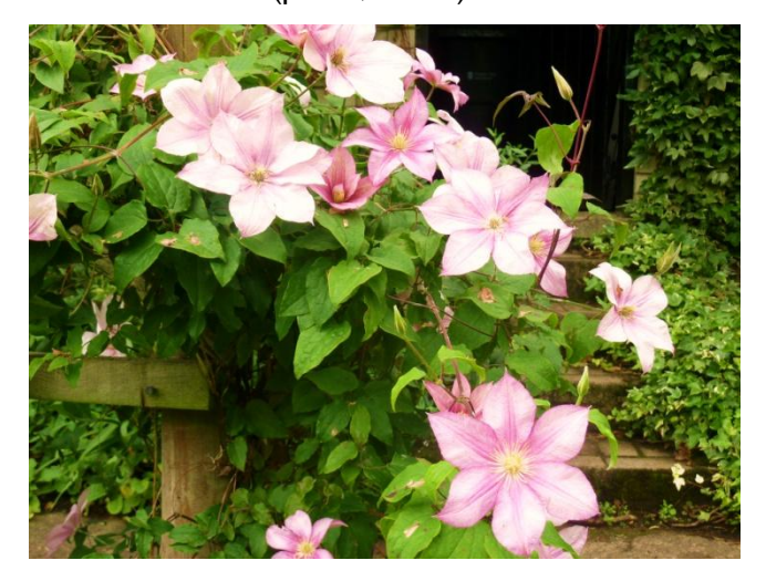
Clematis 'Viola' Corydalis elata Crambe cordifolia

Anemone rivularis Beesia calthifolia Campanula latifolia 'Brantwood' (giant bellflower) Campanula latifolia 'Gloaming' Cardiocrinum giganteum var. yunnanense Clematis 'Caroline' (photo, below)