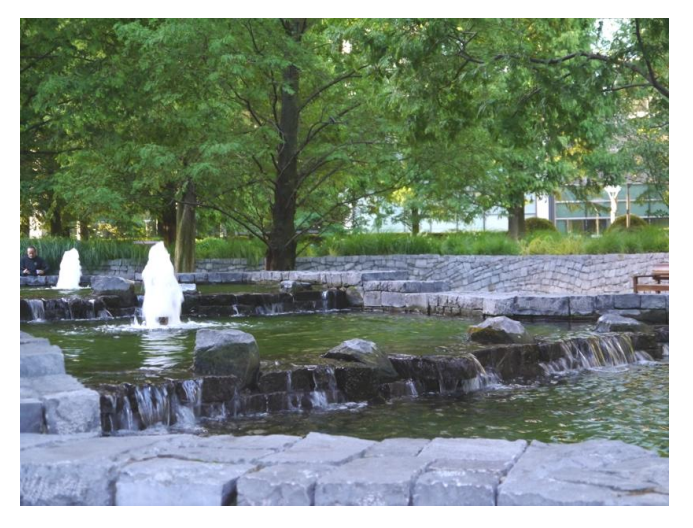
Jubilee Park designed by the Belgian landscapers Jacques and Peter Wirtz, Canary Wharf.

The final development reflects London, through the traditional squares, but also the outward looking international links of the docks and the new financial centre with landscaping that reflects that international community, past and present. For example, the Jubilee Park, was designed by the Belgian landscapers Jacques and Peter Wirtz, and contains dawn redwood, Japanese cherry, swamp cypress and Turner oak trees.