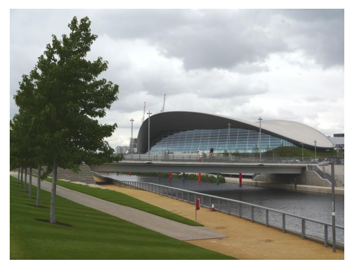
Work underway on the Legacy Masterplan in The South Park. Queen Elizabeth Olympic Park

Well, the tantalising title of the conference was well chosen. The Abercrombie Vision of 1943 in creating a green grid for the East End of London has been achieved, although perhaps in a piecemeal fashion. The