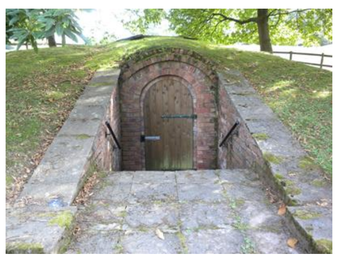
Above: Entrance to icehouse, Rode Hall. This icehouse has had a Grade II listing for nearly 50 years. Below: Conical shape brick chamber, icehouse Rode Hall

Few of these structures were considered an important decorative building within the landscape of an estate. Most were hidden from view, although a fine and rare example of an icehouse used for decorative effect is found here in Cheshire – at Ramsdell Hall. A manmade outcrop of rocks surrounds the pointed-arched entrance topped by carved figures. Another example is Great Moreton Hall where the entry to the icehouse is marked by a six-sided tower decorated with carved heads.