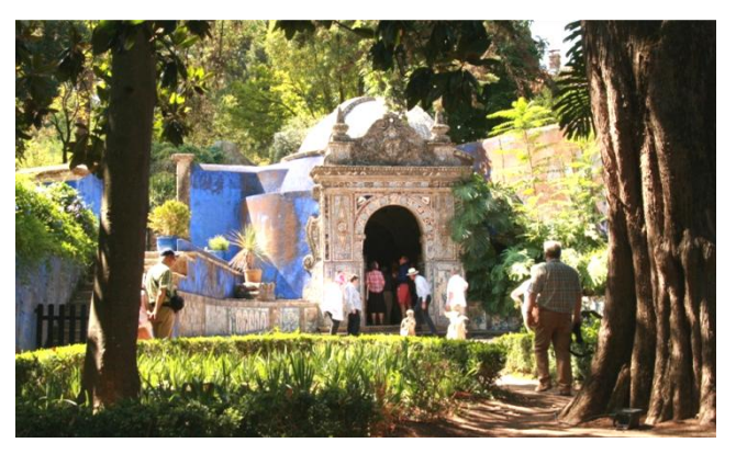
None of us are that keen on the contemporary Moorish addition to the garden. (below)

panels showing allegories of the arts and sciences. The planets and the signs of the zodiac represent life goes on, the portraits in the tiles are the opportunists. There is an exquisite shell-lined grotto.