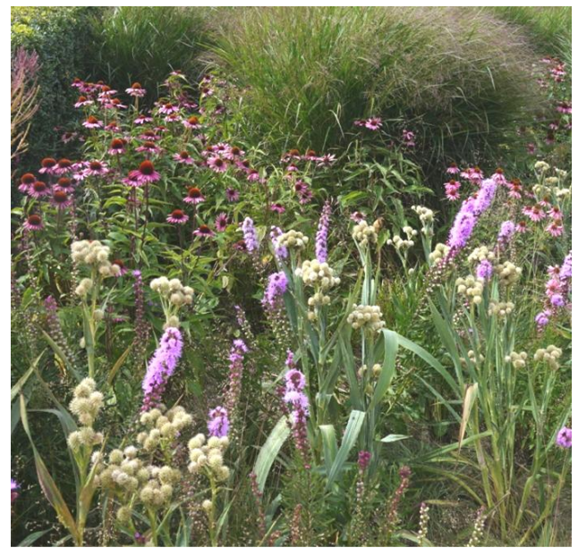
Late season colour in the South Park. Queen Elizabeth Olympic Park

complete in the ecological and green North Park, which is now open to the public. The transformation work will be completed in the entertainment focussed South Park in 2014, when it will open to the public and be open for events again.