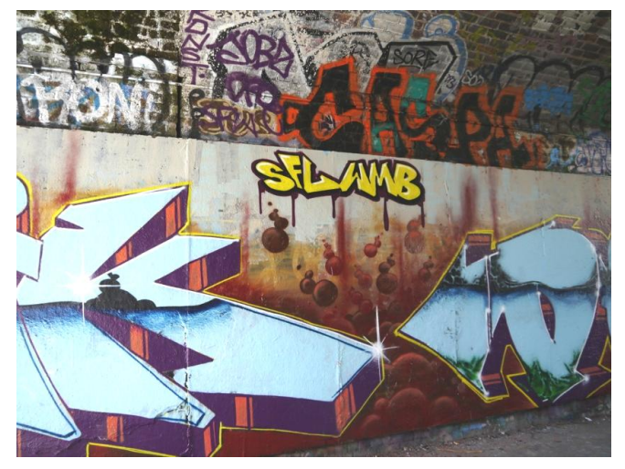
The Graffiti archway, self managed by the artists. Mile End Park

The site of the park was identified in the Abercrombie Plan as suitable for a 90 acre development of green space and the King George's Field opened in 1952, but then little development occurred until the Millennium Commission's call for projects to mark the Millennium gave that opportunity. A combined partnership bid between the Tower Hamlets Environment Trust, the London Borough of Tower Hamlets and the East London Business Alliance made a successful bid for \pounds 12.33m of funding from the Commission, enabling the successful completion of the park that we saw.