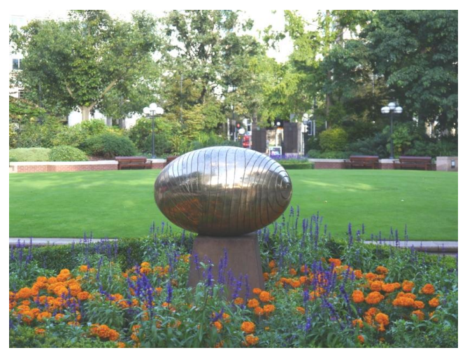
Waterferry Circus Gardens reflects a traditional London Square. With sculpture by Do Vassilakis. Canary Wharf

series of linked open spaces of gardens, squares and, significantly, water for the former dock.